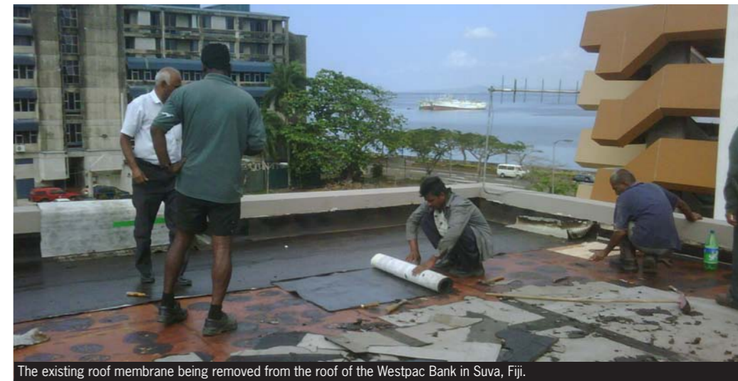
The existing roof membrane being removed from the roof of the Westpac Bank in Suva, Fiji.