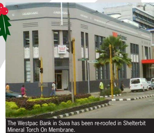
The Westpac Bank in Suva has been re-roofed in Shelterbit Mineral Torch On Membrane.