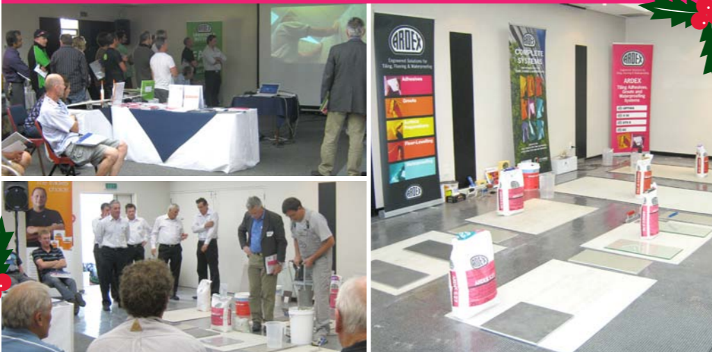
AUCKLAND TILING EVENT - Thursday 4th November