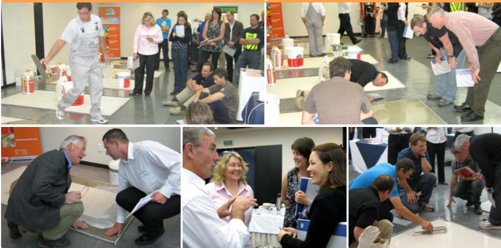
CHRISTCHURCH TILING EVENT - Wednesday 3rd November