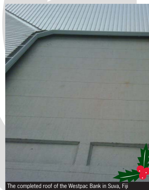
The completed roof of the Westpac Bank in Suva, Fiji