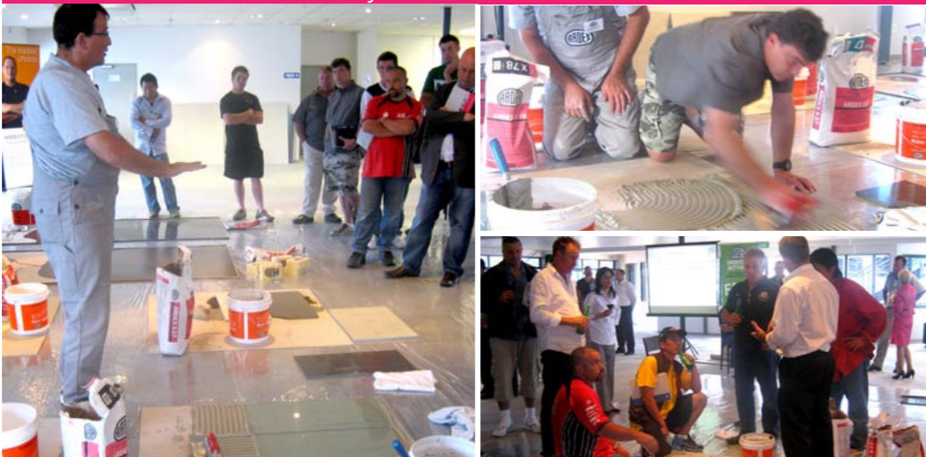
AUCKLAND FLOORING EVENT - Friday 5th November