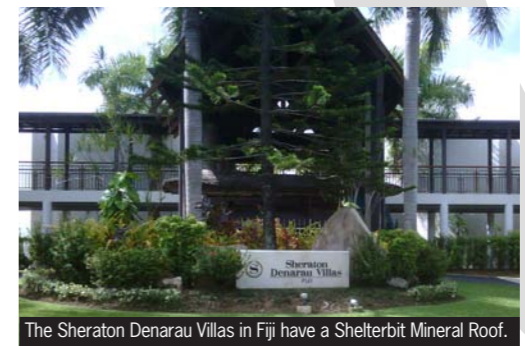
The Sheraton Denarau Villas in Fiji have a Shelterbit Mineral Roof.

ARDEX has a 20 year relationship with local company East West Engineering Ltd and the applicators are very competent in ARDEX total roofing systems. This, combined with the ease of supply from ARDEX New Zealand, ensures that ARDEX products are regularly specified for projects in the Pacific Islands. ARDEX Shelterbit Mineral Torch Applied Membrane was also used to re-roof The Sheraton Denarau Villas in Nadi, Fiji.