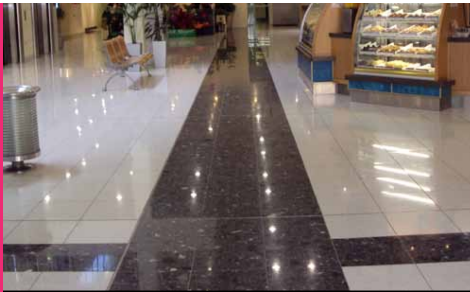
The completed tiled floors of the Centre City Mall in New Plymouth