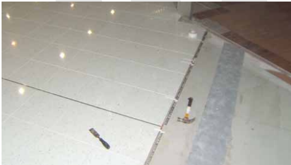
The ARDEX Decoupling Mat is the grey strip to the right of the tiles, clearly visible during installation

The tiling crew was provided by Warren Barnes (10 people) with an outstanding installation process and an excellent finished result.