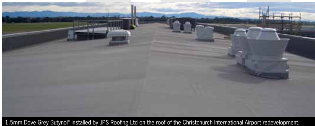
1.5mm Dove Grey Butynol® installed by JPS Roofing Ltd on the roof of the Christchurch International Airport redevelopment.

The new terminal will offer a first class airport experience, including large passenger lounges, extra seating, improved passenger flows and enhanced retail and cafe areas. With the new carpark building already finished, the terminal is expected to be completed by February - March 2011. The final stages of the redevelopment are likely to be completed by mid 2013.