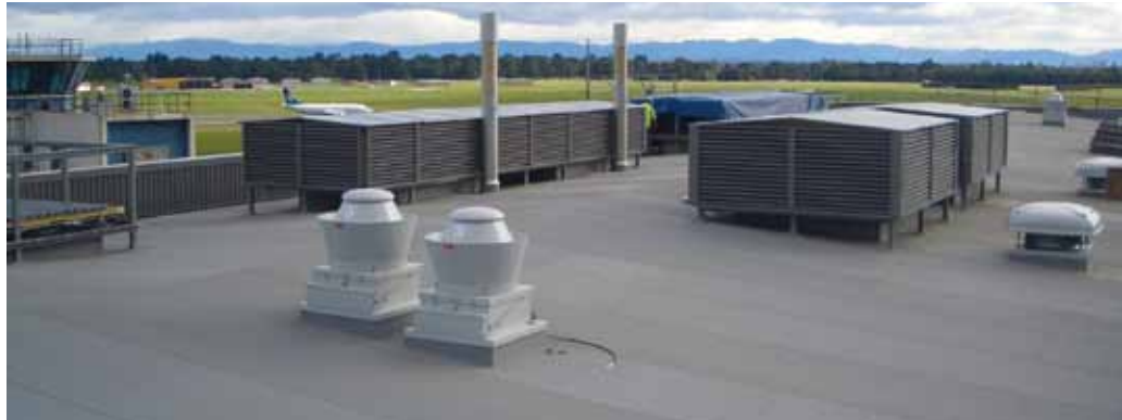
Approximately 3000m 2 of ARDEX Butynol® has been used in this project. The old Airways tower can be seen on the left.