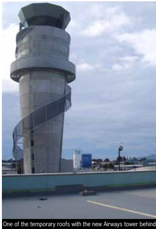
One of the temporary roofs with the new Airways tower behind.

JPS Roofing Ltd secured the contract for membrane roofing on the Christchurch International Airport Terminal redevelopment. This is the largest building project in the South Island at present. Butynol® 1.5mm Dove Grey has been used on an area approximately 3000m 2 .