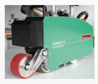
Membrane seams are welded on-site with an automatic Varimat Leister