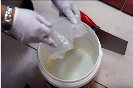
Mixing the combined Parts A+B resins and then adding the filler powder.

TIP: It is important that resin is mixed first before the powder is added. This makes sure the two resin components are correctly combined to react.