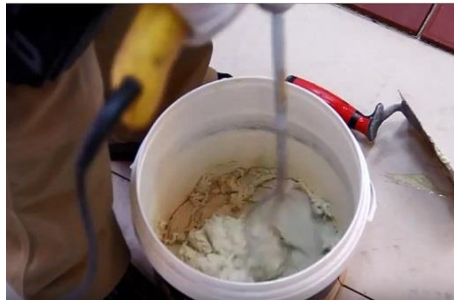
Mixing in the filler powder