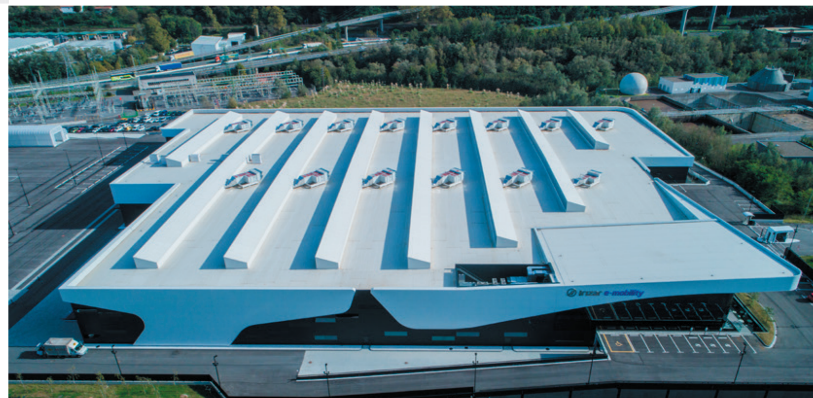
Irizar e-mobility (Spain)