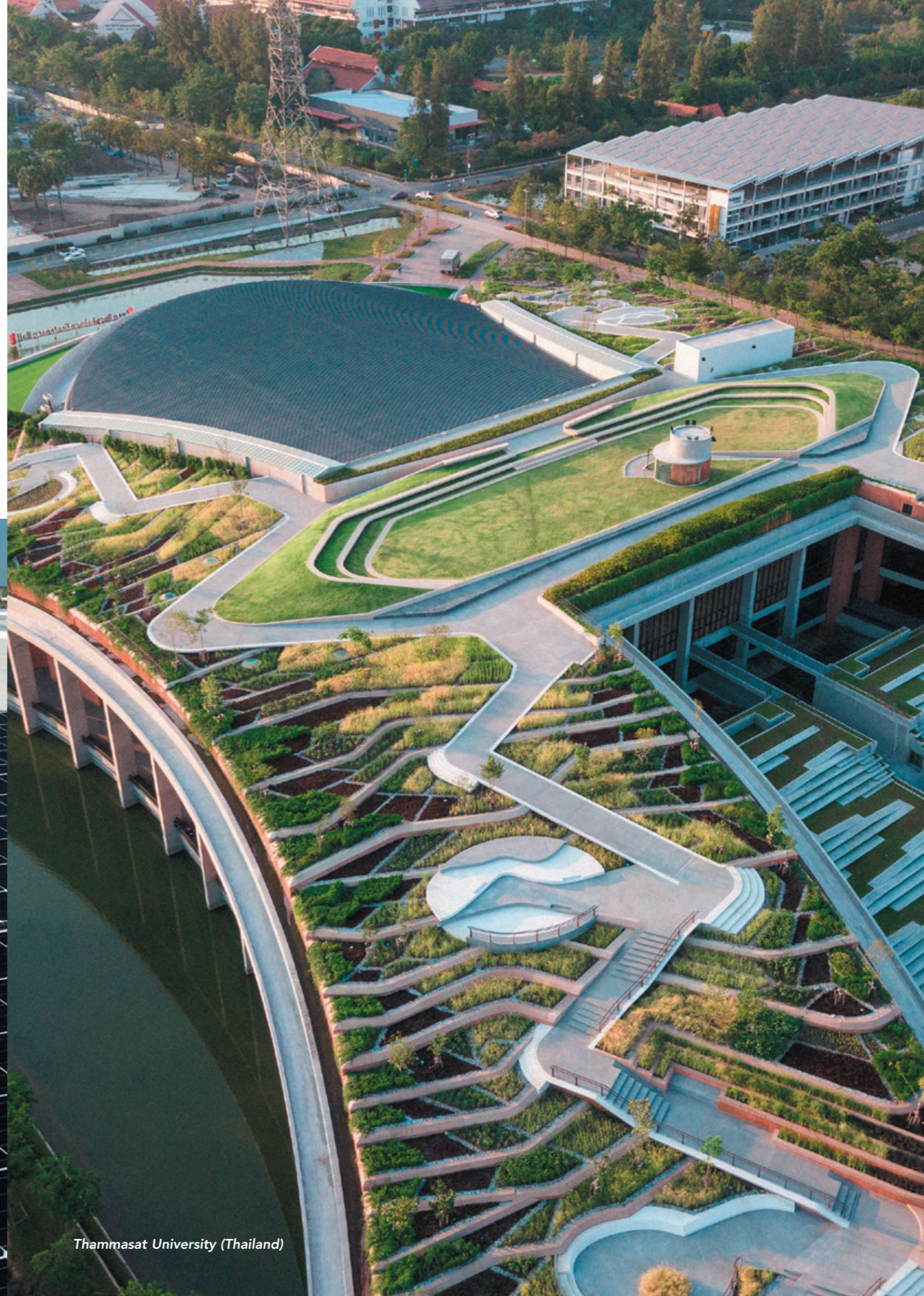
Thammasat University (Thailand)