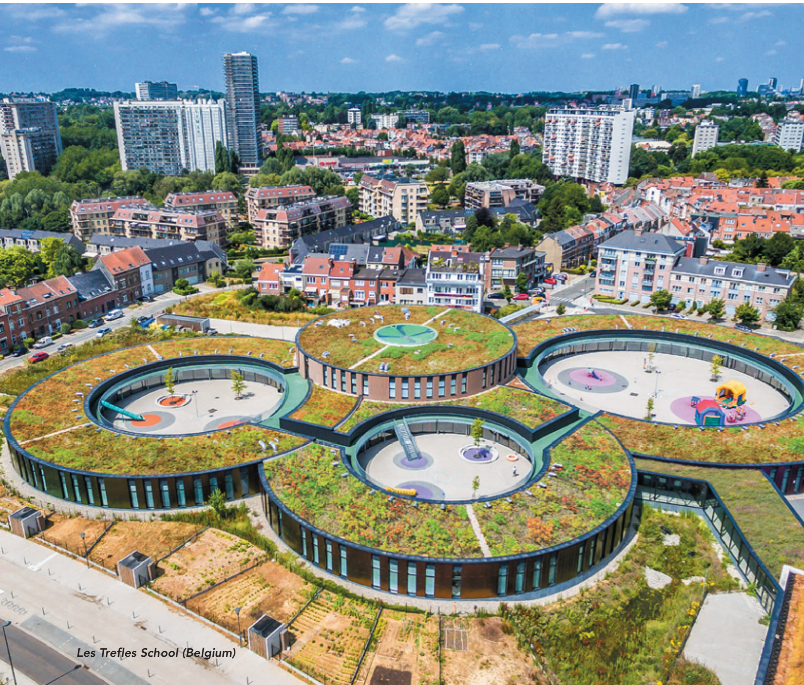
Les Treffles School (Belgium)

The same membrane can be used for all roof areas (main roof area, upstands, etc), all applications (green roofs, solar roofs, etc) and all types of systems. Its wide welding window further facilitates installation.