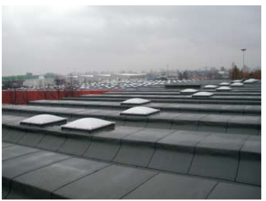
Shelterbit Phoenix Star Mineral - Shopping Centre in Cussignacco, North Italy (3,000m<sup>2</sup>).