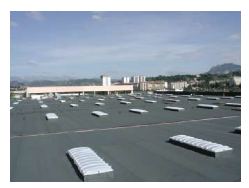
Shelterbit Phoenix Star Mineral - Shopping Centre in Ascoli, South Italy (14,000m<sup>2</sup>).

1.2 The products are supplied as torch-on and adhesive fixed, reinforced, polymermodified bitumen sheets in roll form.